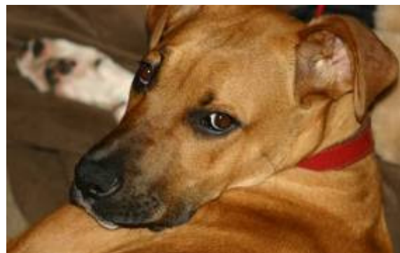
Kane looking worried before his leg-saving operation. He has a much bigger smile on his face now, and is waiting to be adopted.

All funds received from our adoption fees are used towards the rescue and rehabilitation of other dogs.