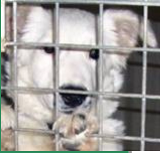
Penny, a beautiful Border Collie X rescued from Mildura Pound recently and placed in our foster care program

'Most dogs end up on death row due to no fault of their own... Many in our community regard dogs and cats as disposable items.'